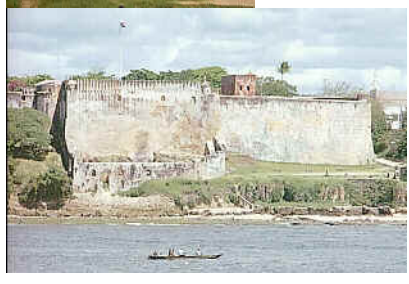
Fort Jesus, Mombasa, Kenya